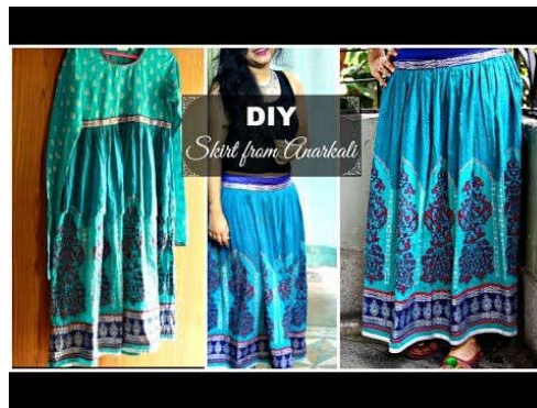
Old Anarkali Kurta is redesigned as Maxi Skirt through DIY activity

If you're in love with your clothes despite wear and tears, you can always redesign them up or create a new style! A simple online YouTube classes will give you all the tools you need to revitalize your most beloved pieces.