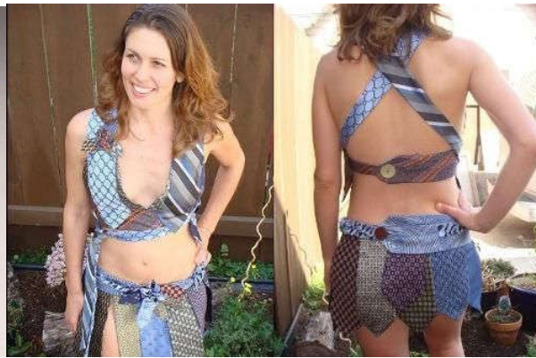
Innovative attire created from unused ties

Waste junk bottle caps and cereal boxes lying in your house trash? Save them; create a neck piece and it can make a great fashion statement. Those unused extra ties from your father and brother's wardrobe will finally come to life if they can be redesigned with this tie skirt ensemble.