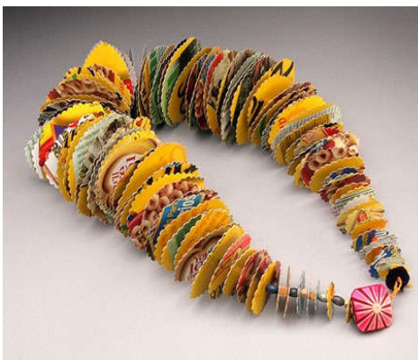
Neck piece made by cereal boxes

If you have a handful of unused junk materials and you don't want to store them at home, then turn them into something useful—like fashion accessories. Yes, we are talking about making a fashion statement from recycled materials. There is lot of waste like old electronic items, artificial jewelry, plastic goods etc. Fortunately, we have a variety of options for dealing with our discarded stuff. Here are tips for things you can do with old waste materials.