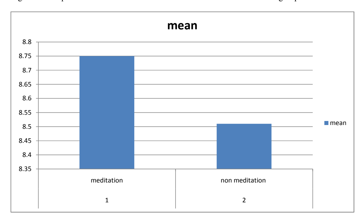
Figure 2: Comparison of GPA score between meditation and non-meditation groups