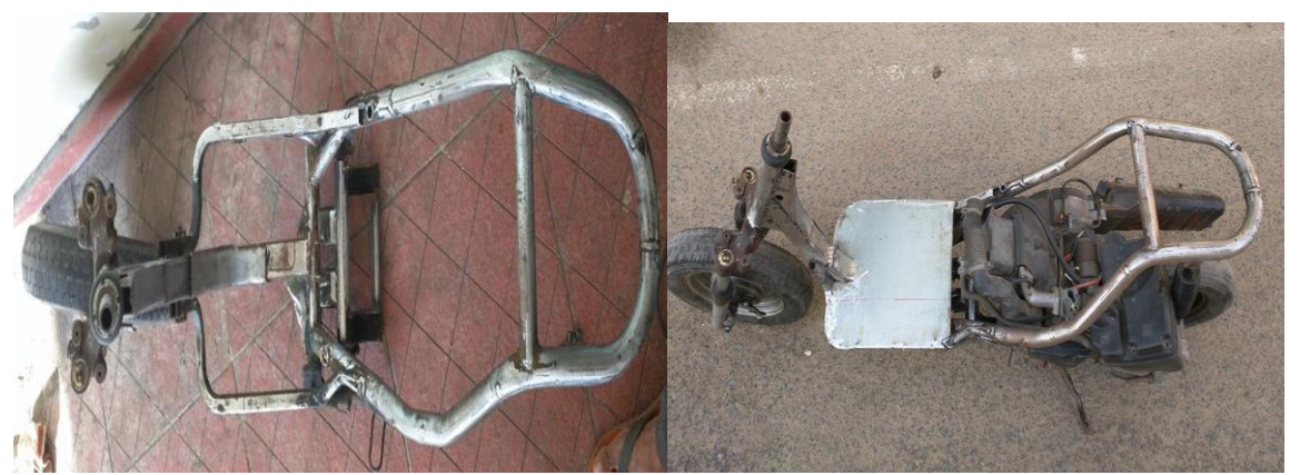
Figure 2.1 Frame without engine

The frame is, in an effort to both minimize weight and manufacturing complexity, a stepthrough frame. This frame allows for simple load transfer, and the frame is to be made of stream line design, allowing for minimal manufacturing time, and allowing for the use of automated manufacturing techniques. This design has been used successfully in commercial vehicles, which is the strongest configuration between the front wheel assembly and the frame.