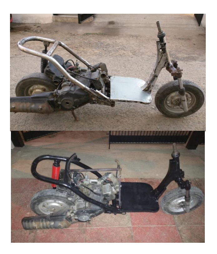
Fig.3.1 Fabricated Two Wheeler

Followed by the fabrication of the actual model, the model has been tested for different road, different load and various environmental conditions to identify any defects or flaws in the design or fabrication processes, and eventually no defects or flaws where noticed or observed.