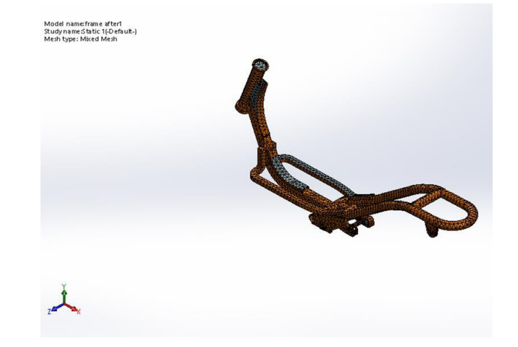
Fig 3.1 Meshed Model