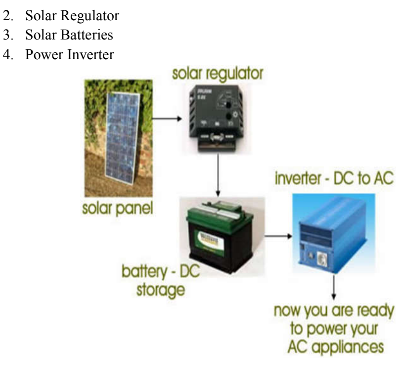
Figure 3 Components of Solar Power System