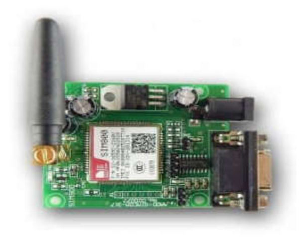
Fig (4.2) GPRS modem

internet. GPRS module will help us to post data in the web page directly.