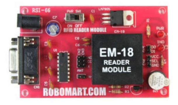
Fig (4.4) RFID Module

Radio Frequency Identification (RFID) is a generic term for non-contacting technologies that use radio waves to automatically identify people or objects. The combined antenna and microchip are called an "RFID transponder" or "RFID tag" and work in combination with an "RFID reader". Radio Frequency Identification (RFID) is the latest technology that is being adopted to track and trace materials, including books.