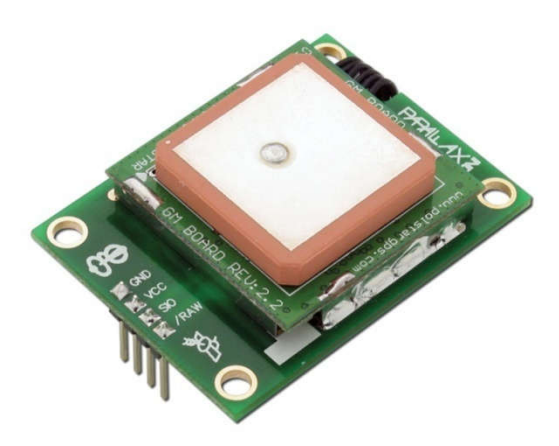
Fig (4.3) GPS Module

A GPS modem is used to get the signals and receive the signals from the satellites. In this project, GPS modem get the signals from the satellites and those are given to the