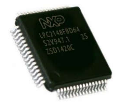
Fig (4.1) Microcontroller

The \mu C is the final decision making body on the system. The logic is developed and then the program is burned inside the microcontroller and the other peripherals are accessed via microcontroller only. The ARM7TDMI-S is a general purpose 32-bit microprocessor, which offers high-performance and very low power consumption. In this system controller is the most important part.