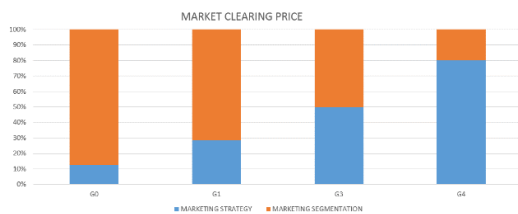
Fig. 1. “Uniform-Price” auction model

“Pay-as-Bid” auction method is different from “Uniform Price” auction method, the clearing price is determined as bid price for each bidding company. When the bidding strategy shown in Figure 2 is taken, the balancing power supplier who made a successful bid in balancing power market are G1, G3, G2 and part of G4, and the clearing price of each successful bidder carries out market clearing at each bidding price. The area of the yellow portion in Figure 2 represents the profit of each supplier. Therefore, in order to maximize the profit of each bidding supplier, it is important to predict the market settlement price as accurately as possible and to bid accordingly. From figure (3) it can observe that the output of analysis of marketing strategy and marketing segmentation.